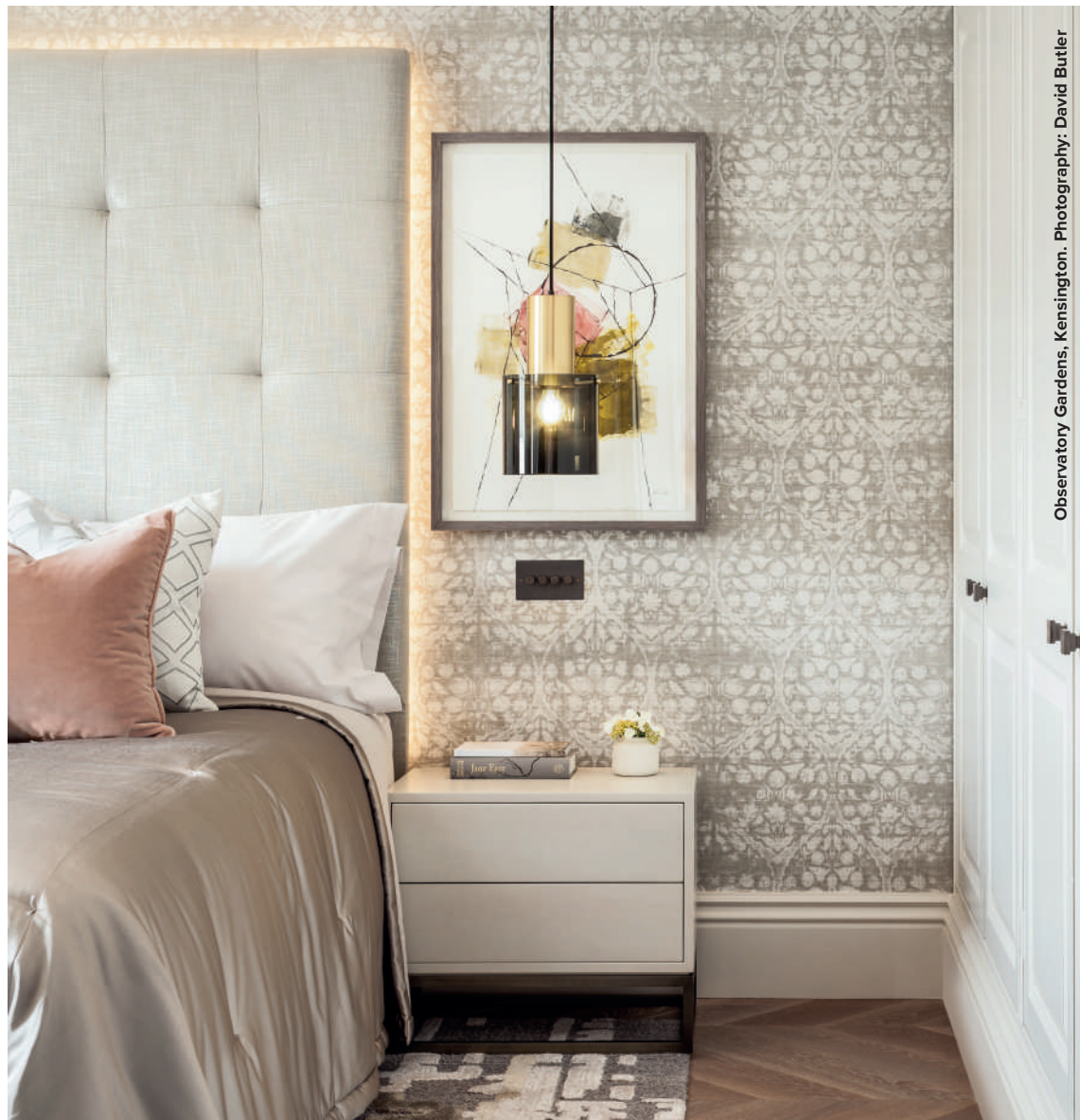
Observatory Gardens, Kensington.